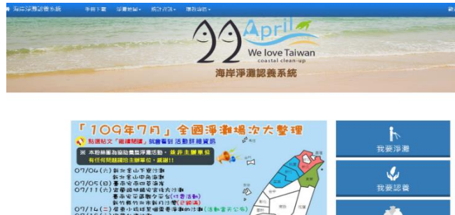
Figure 1. EPA's Coastal cleanup website