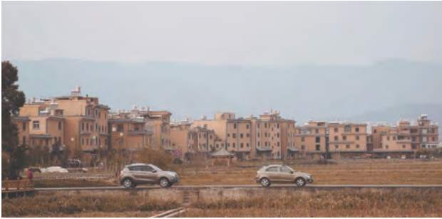
[Mafang Village, New socialist eco-village in Chengjiang].