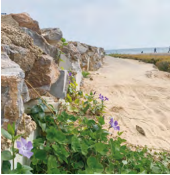
[In replacement to its cobble stoned lake beach, the artificial sand beach in Cheng Jiang must be water-sprayed continuously, in order to stop the strong lake wind blowing its sand dunes into neighboring wet land and arable land.]

Public goods and public commons should find a compatible way to negotiate the menacingly growing private property vandalism and appropriation. The ownership of nature (not being corroded by dis-ownership of other species to their habitats) should first of all be designed by mankind under the umbrella of mutuality and reciprocity, mediated by bundles of rights and duties. The capitalization of nature and mobilization of nature should shift towards a moral stewardship of land and water, by leaving blank spots and protecting future generation and fauna/flora living elsewhere