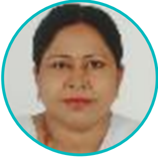
HON. PRAMILA YADAV FORMER STATE MINISTER FOR EDUCATION, SCIENCE & TECHNOLOGY NEPAL

Hon. Pramila Yadav is a former State Minister for Education, Science and Technology of Nepal. She is also holding the position of Central Member and Politburo Member of the People's Socialist Party, Nepal