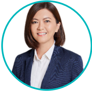
HON. SANDREA NG MEMBER OF PARLIAMENT MALAYSIA

Hon. Sandra Ng is a student activist turned state lawmaker from Malaysia, representing The People's Justice Party. She was first elected in the historic general election in 2018 that witnessed the first regime change in Malaysia since its independence.