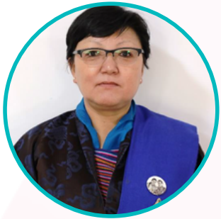
HON. TASHI CHHOZOM EMINENT MEMBER OF PARLIAMENT BHUTAN

Hon. KCD contributed to the efforts of encouraging women leadership and continues to advocate for the rights of girls and women in her current responsibility.