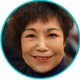
HON. DR. SANDY (YU LAN) YU FORMER MEMBER OF PARLIAMENT TAIWAN

Hon. Dr. Sandy (Yu Lan) Yu , also known as Sandy Yeh, was a legislator at large representing Kuomintang (KMT), the largest opposition party of Taiwan, the Republic of China till Jan. 31st 2024.