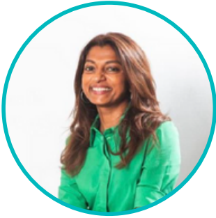
HON. EVA ABDULLA MEMBER OF PARLIAMENT MALDIVES

Hon. Eva Abdulla has been a representing member of parliament of the People's Majlis (Parliament of Maldives) since 2009. She also previously held the position of Deputy Speaker of the People's Majlis for the 19th Majlis until her resignation on 3rd December 2023.