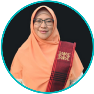
HON. LEDIA HANIFA AMALIAH MEMBER OF PARLIAMENT INDONESIA

Hon. Ledia Hanifa Amaliah is a member of the The House of Representatives of the Republic of Indonesia (DPR RI) from the Prosperous Justice Party (PKS) for the Bandung City and Cimahi City electoral districts who really cares about issues of Education, Family and People with Disabilities.