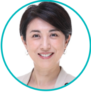
HON. SHIZUKA TERATA MEMBER OF PARLIAMENT JAPAN

Hon. Shizuka Terata is a member of the House of Councillors in Japan, first elected in 2019 from the Akita Prefectural district. She graduated from Waseda University with a Bachelor of Arts degree in Human Sciences in 1998.